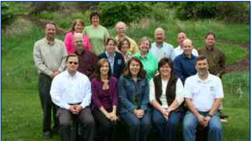
2008-09 PROP Board of Directors